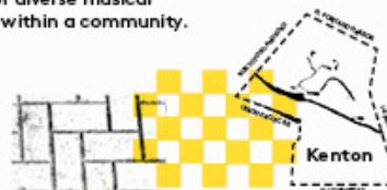
Assorted textures of Kenton

— Peninsula School in collaboration with Caldera